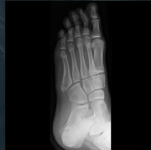
Fx Base of 5th metatarsal