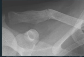
Fx middle third of clavicle