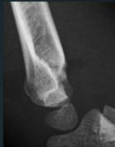
Ped : Supracondylar Fx c posterior displacement