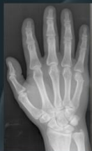
Fx of metacarpal neck Boxer's fracture