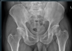
Femoral neck Fx