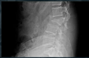
Compression Fx of vertebra