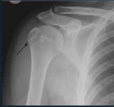
Fx of Greater tuberosity of humerus