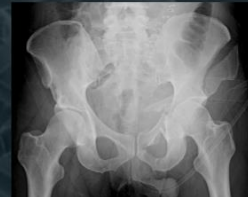
pubic ring Fx