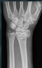
Fx of distal end radius c Fx distal ulna