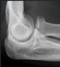
Fx of head and neck of radius