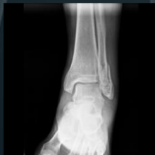
lateral malleolus Fx